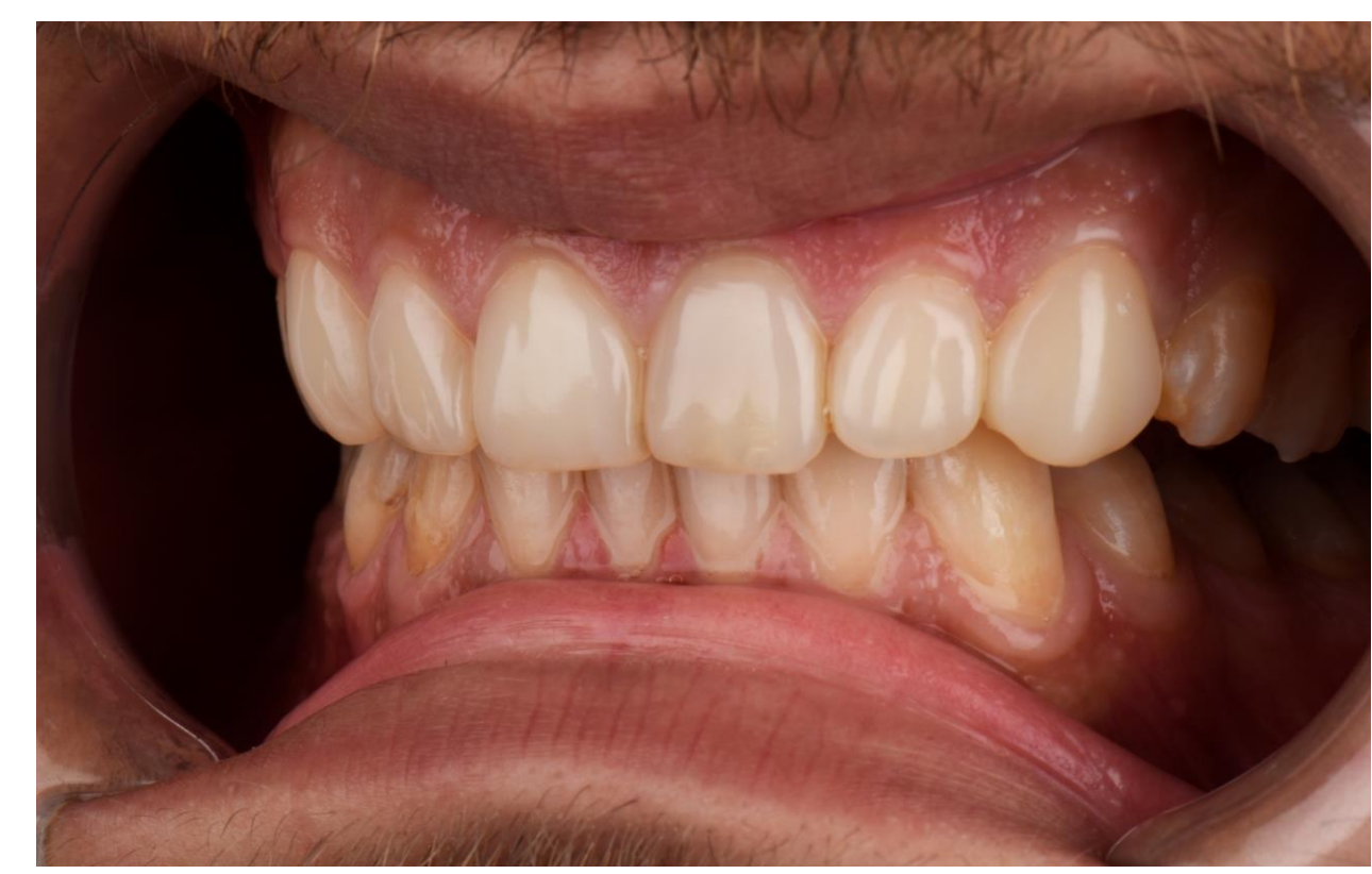
Final result, close up view