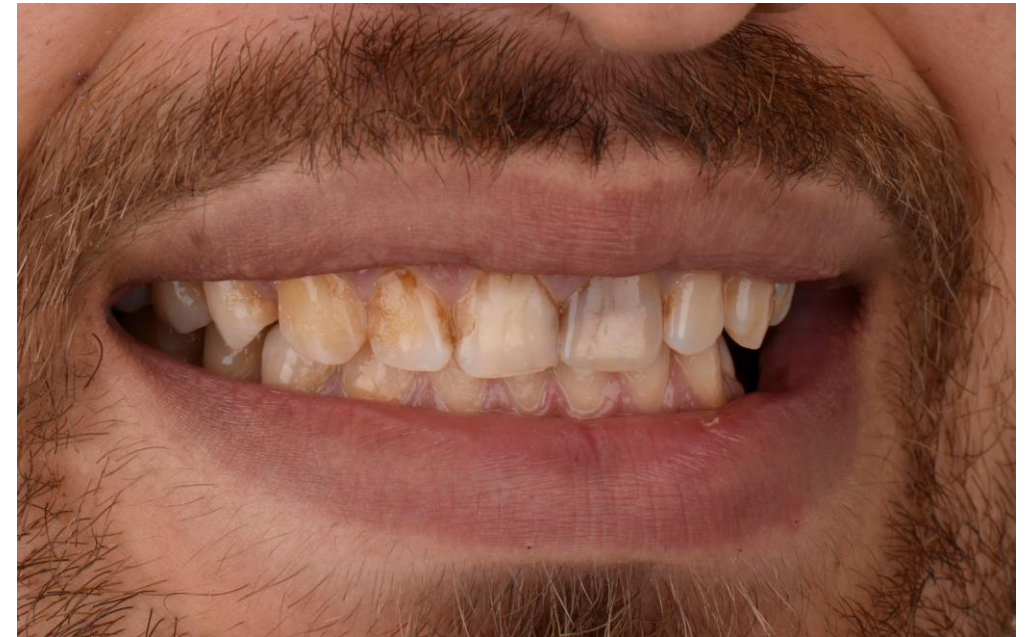
Initial smile presenting multiple carries and discoloration